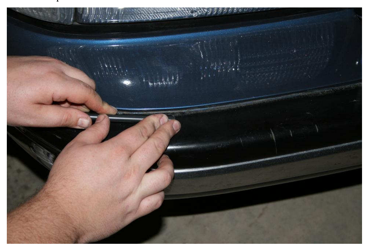
Here is the bumper cleaned off.

Now you need to remove all of the remaining adhesive tape. A plastic scraper or any flat tool will work here too. Again, be careful not to scrape your bumper cover. Placing the car in the sun for a bit will help to soften the tape.